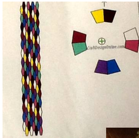
Diagrams by Nikki Kenney. You can design your own at http://www.craftdesignonline.com/kumihimo/