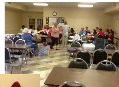
Eager students preparing to make bracelets.