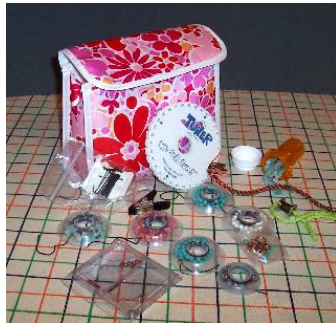
The bag and containers.