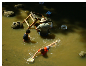
Sieving in the creek.