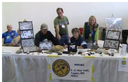
The crew preparing for work. Photo by Jim Roberts..