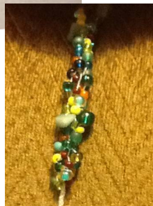
Beaded Kumihimo Bracelet in progress

Editor's Note: at the author's request her contribution was put in purple. I was told it was the least I could do for 'going on and on' about the Black Belt.